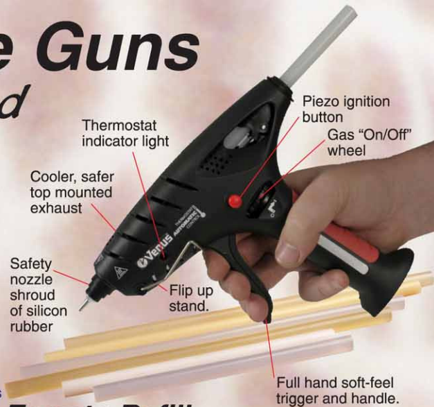
Thermostat indicator light Piezo ignition button Gas "On/Off" wheel Cooler, safer top mounted exhaust Safety nozzle shroud of silicon rubber Flip up stand. Full hand soft-feel trigger and handle.