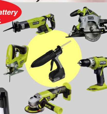
Add a Venus Glue Gun to your Ryobi tool kit.

Used for attaching low voltage security and telephone cables, window dressing and exhibition displays, car body repairs and attaching carpet gripper to floors. Warms up in only 3 minutes and when fully charged operates for approx. 30-35 minutes. Powered by a Ryobi 18V .5Ah lithium+ battery and charger. Melt Rate: 1.9kg per hour. Weight gun only: 530g, gun with battery: 980g.