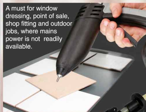
A must for window dressing, point of sale, shop fitting and outdoor jobs, where mains power is not readily available.