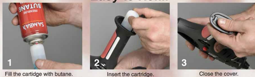
1 Fill the cartridge with butane. 2 Insert the cartridge. 3 Close the cover.

Comes in a tough carry case with a choice of special purpose Venus hotmelt glues for cabling, flooring or auto dent repair.