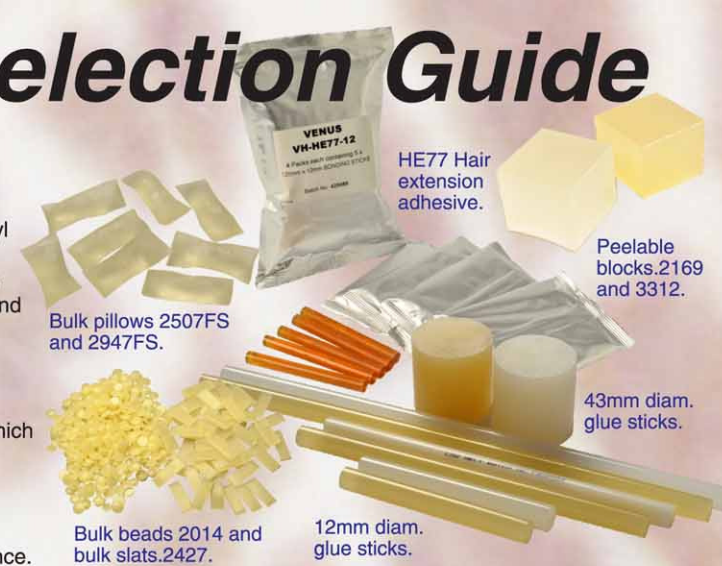
Bulk pillows 2507FS and 2947FS.

Viscosity: The liquidity of the adhesive in its hot state, quoted in centipoise (CPS). The lower the CPS value the thinner the liquid. Water has a value of 1 CPS. Open Time: The maximum working time before the adhesive cools to a point at which only marginal bonding can take place. Varies according to application conditions including ambient and substrate temperature. Temperature Resistance: Resistance of the bond to heat and cold. Important to electronic component assembly and deep freeze packaging. Polyamide Glues: High performance. Excellent chemical and temperature resistance.