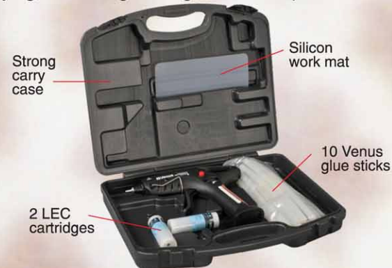
Strong carry case Silicon work mat 10 Venus glue sticks 2 LEC cartridges

The GasGlue 600 runs on refillable (LEC) liquid energy cartridges. It doesn't require mains electricity or batteries and weighs just 390g. Each LEC refills from a standard butane cigarette lighter canister and keeps the GasGlue 600 running for approximately 1.5 hours. To start up just turn the gas dial and press the Piezo ignition button. The GasGlue 600 reaches operating temperature in just 5 minutes and is thermostatically controlled to give the optimum temperature for the best glue delivery. Because it is totally portable the GasGlue 600 is the ideal glue gun for applications where mains power might not be available: shop fitting, exhibition displays, flooring and carpet laying, low voltage wiring, car dent repairs. Melt rate: 1.7kg per hour.