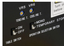
Table switch, turns photo electric sensor on or off. Mode switch, selects "Mono" for sequential banding or "Temporary" for one off banding.

Main controls: Power On Light, Tape Feed, Reset, and Start buttons.